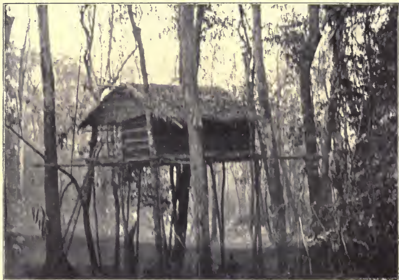
FOREST LODGE THE FIRST.